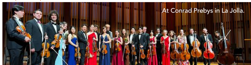
At Conrad Prebys in La Jolla.