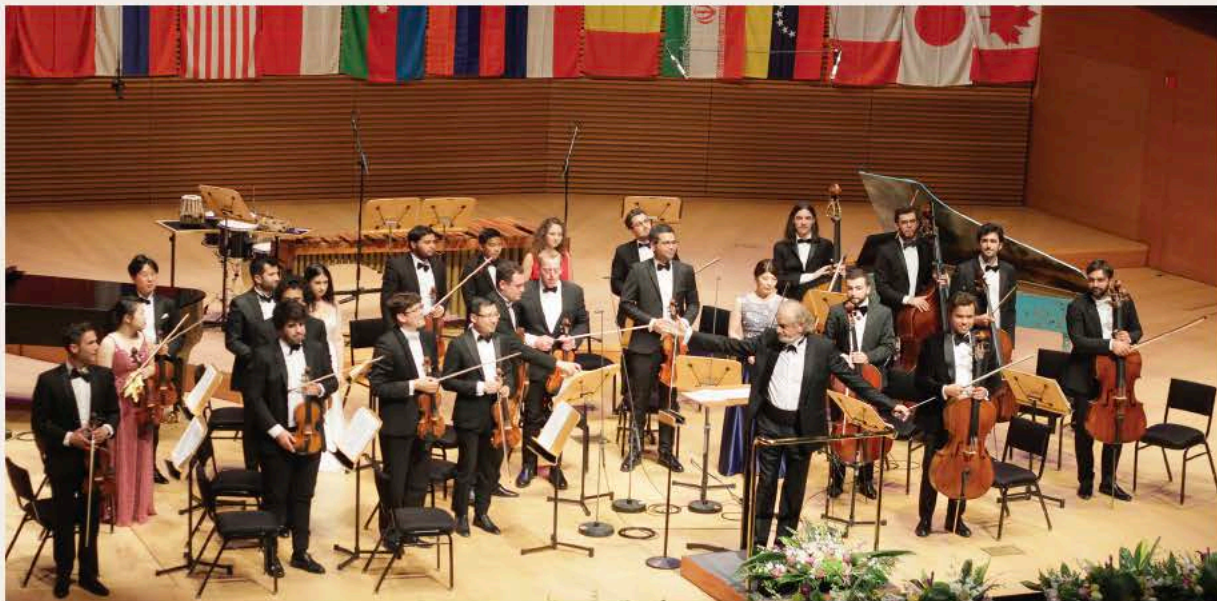
iPalpiti 2019 (Last Live Photo on Disney Hall Stage)