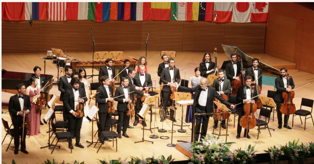
iPalpiti 2019 (Last Live Photo on Stage)

Looking forward to greeting you IN PERSON at the concerts!