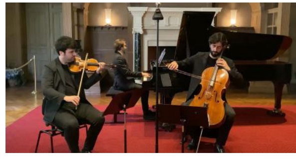
LIVE FROM PARIS: Trio Zadig was scheduled to return as soloists at Walt Disney Concert Hall in Beethoven's Triple Concerto. For this In the Time of Corona festival, the Trio has recorded a very special program with LOVE from Paris to our very special audiences: Dvořák Dumky Trio and Tchaikovsky' Seasons. As resident artists of the famed Foundation Singer-Polignac, the concert was recorded in the concert space of the Foundation' castle.