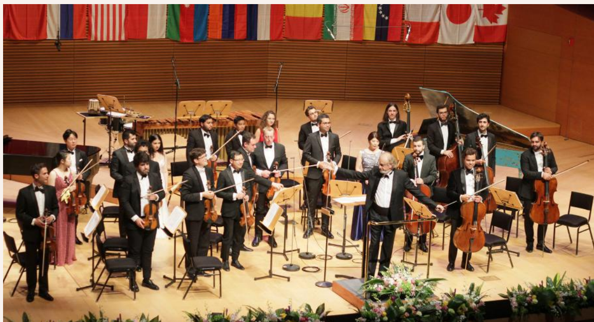
iPalpiti 2019. Dana Ross, Photographer

May we all be blessed by the touch of higher harmony!