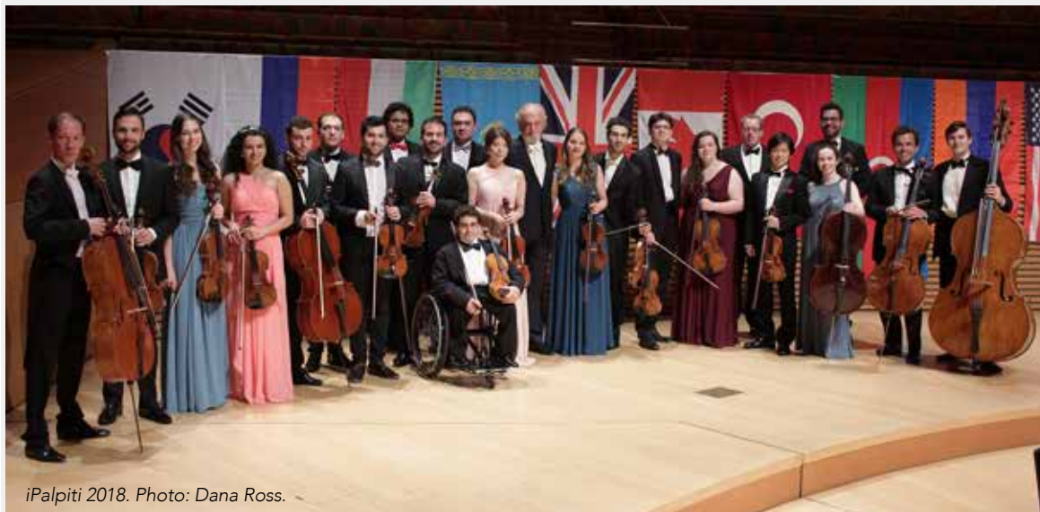
iPalpiti 2018.

1900 Avenue of the Stars Suite 1880 Los Angeles, CA 90067 Tel: 310.205.0511 Fax: 323.969.8742 Email: info@iPalpiti.org www.iPalpiti.org