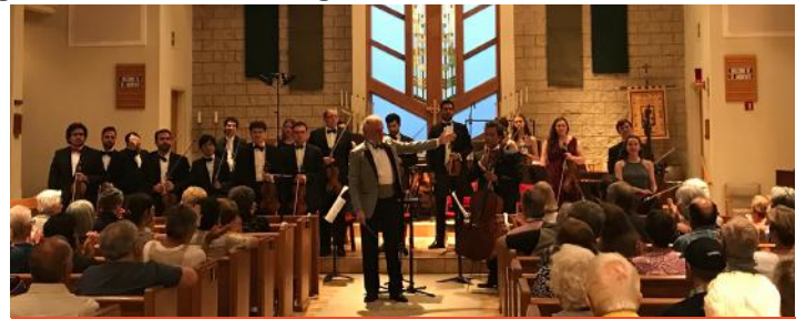
Concert at the Encinitas St. Andrews Church