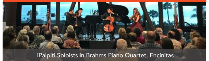
iPalpiti Soloists in Brahms Piano Quartet, Encinitas

At the final concert at the Greystone Mansion, the soloists played their heart out in their favorite selections from the Festival's repertoire, including Kreisler's violin duet arrangements, Auerbach's "Tryptich" Piano Trio, Andante from Brahms Piano Quartet, "Drums" from Ripper Piano Quintet and Dvorak String Quintet.