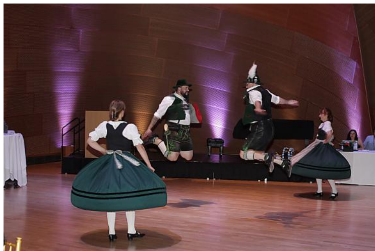
World dancing in honor of musicians' countries included Bavarian ensemble and Tango champions with iPalpiti's Sami (Argentina) & Sam (USA) playing.