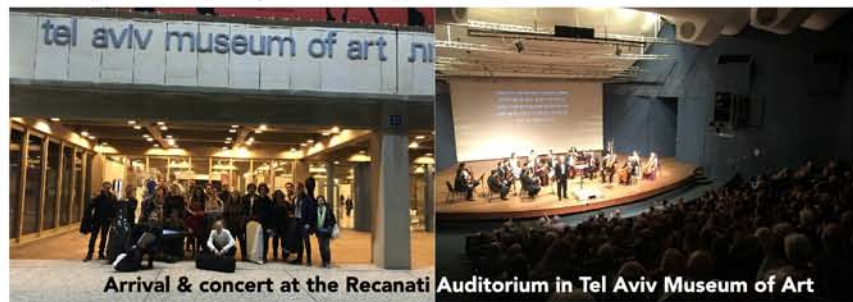
Arrival & concert at the Recanati Auditorium in Tel Aviv Museum of Art

The residence started in Keshet Eilon (the only Performing Arts Center kibbutz in Israel). SEVEN sold-out concerts were given in nine days in Tel Aviv Arts Museum, YMCA Jerusalem, Ashkelon, Petach Tikva, Richon LeZion performing centers, with the final concert in Haifa. On free days, we sent musicians on tours to Masada, Dead Sea, Zfat, and Old City, including Western Wall.