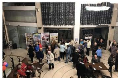
Pre-concert lobby at Ashkelon