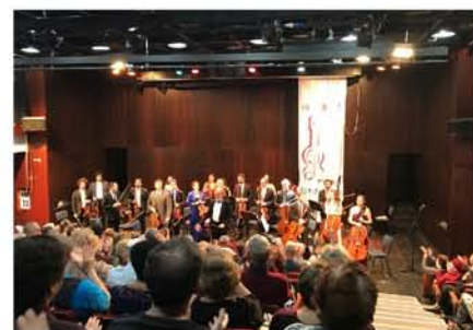
Concert at Richon LeZion