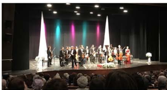
Concert at Hatarbut Petach Tikva