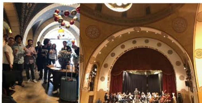
Arrival to Jerusalem' 3 Arches HOTEL & concert at YMCA