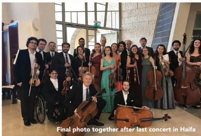
Final photo together after last concert in Haifa