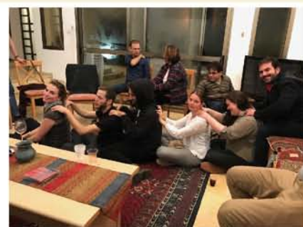
Post-rehearsal massage "train"