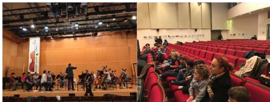
Daily rehearsals in-residency at Keshet Eilon, with local "young audiences"