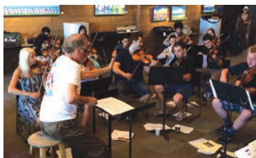
First day arrival rehearsal

Responding to intense audience demand from points south, Festival began with a return to Encinitas, featuring five soloists in daily concerts from July 9-12 at their ocean-view Encinitas Library. The City of Encinitas enthusiastically embraced iPalpiti, so in the following week, entire iPalpiti arrived to this lovely ocean community (a huge bonus for our musicians to be 3 blocks from the beach!), preparing exciting programs for SOKA and Los Angeles and present Virtuosi V recital and FREE community orchestra concert at San Dieguitos Amphitheater.