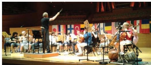
Rehearsal at the Disney Concert Hall.