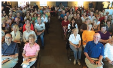
Full house every day.