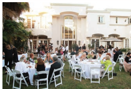
Guests arriving - dinner