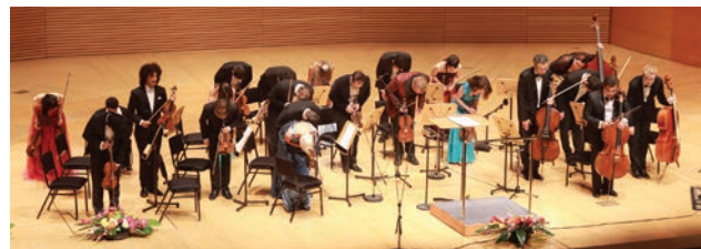
Final bow: well-deserved 7 minutes (!) of applause