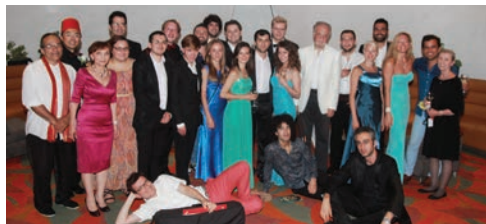
Finale Finale... relax