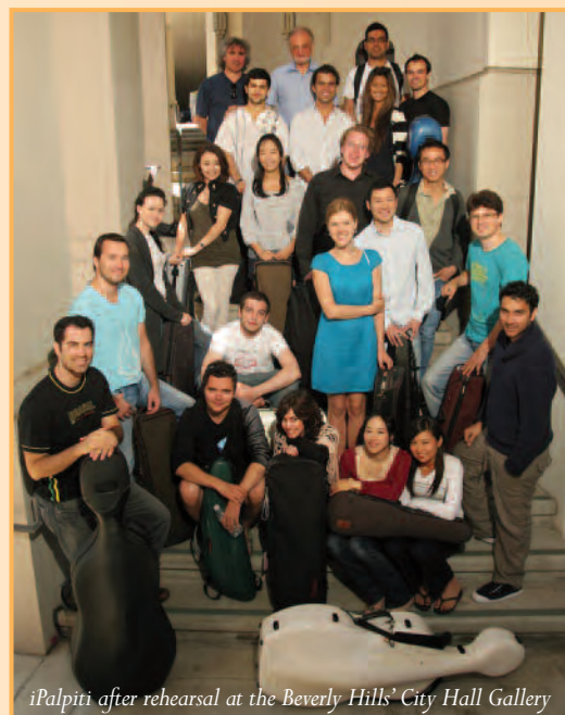
iPalpiti after rehearsal at the Beverly Hills' City Hall Gallery