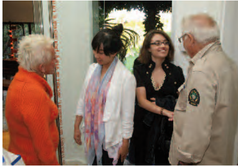
Generous and Welcoming Hosts