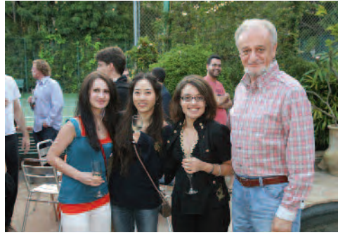
a relaxed Maestro