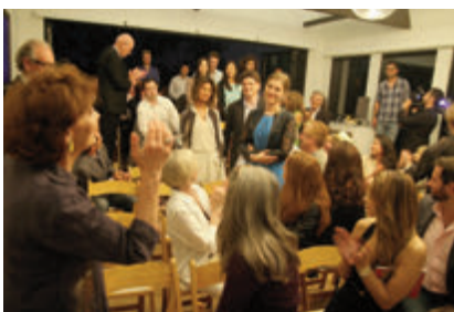
The audience salutes iPalpiti artists