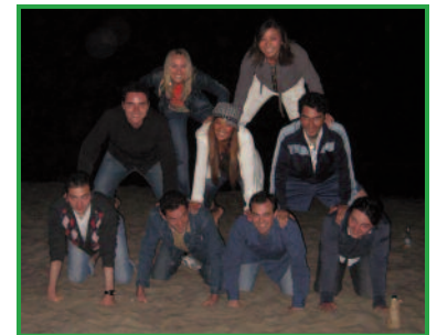
iPalpiti pyramid (the beach)