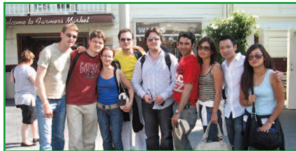
iPalpiti shopping at the Grove