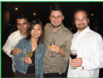
iPalpiti cellos (without!)