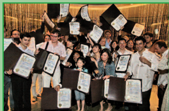
iPalpiti shows off City Proclamations