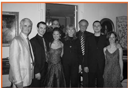
iPalpiti artists and hosts at the February 7 event.