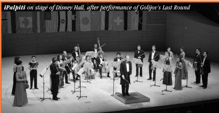
iPalpiti on stage of Disney Hall, after performance of Golijov's Last Round